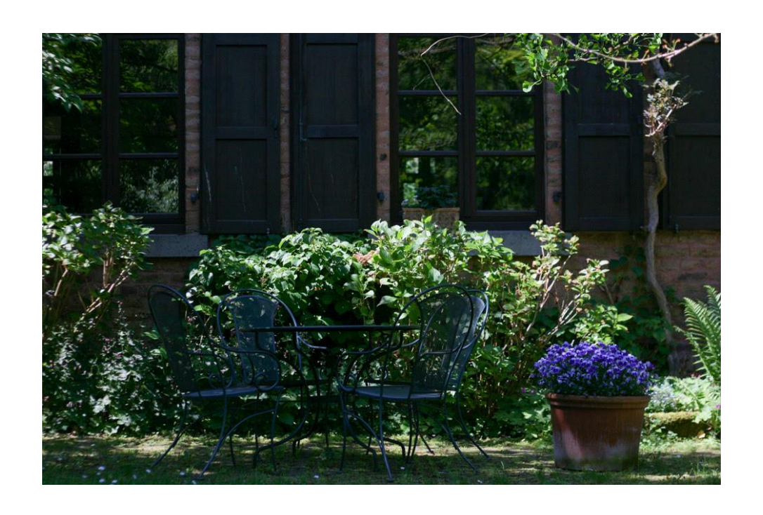
Alten Schule, Königswinter